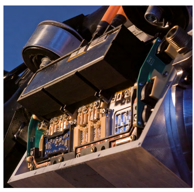
Single-wheel axle drive with attached double inverter.